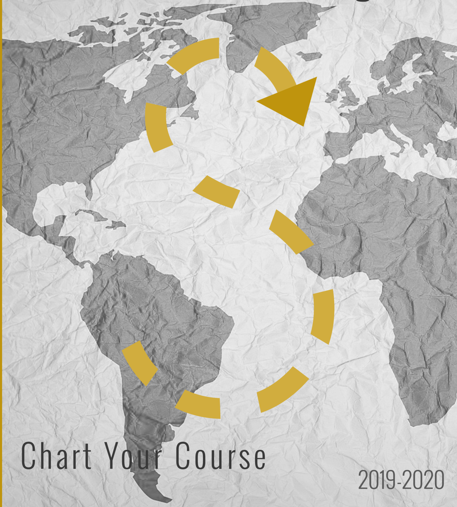
Chart Your Course